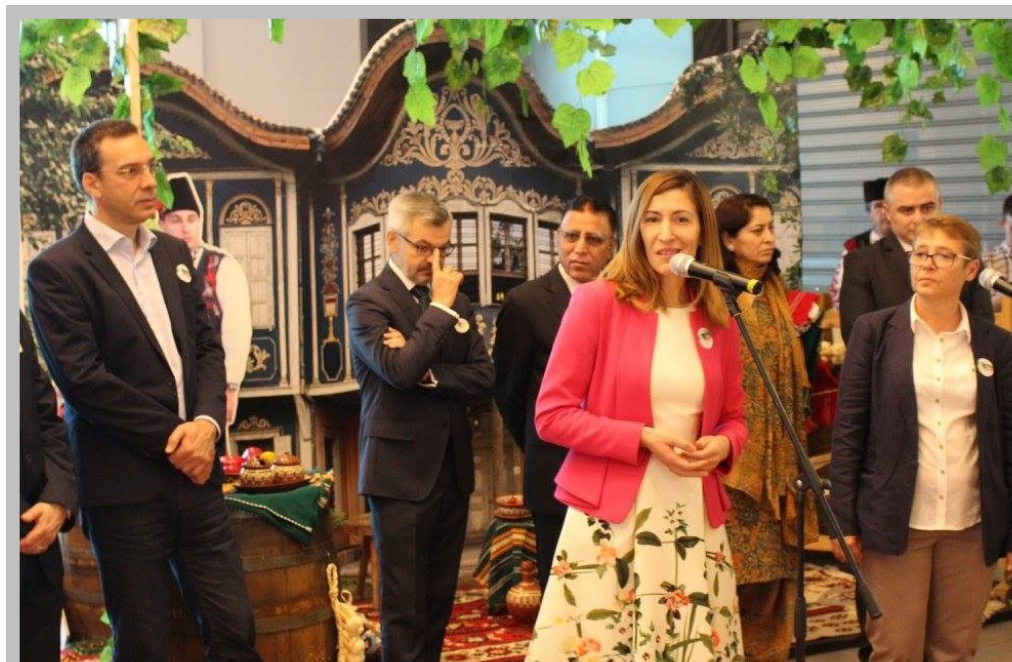
Minister Angelkova, the mayor of Burgas Dimitar Nikolov and foreign mission diplomats during the opening of the International Food Festival

“The results indicate that there is an ever increasing interest in the online register of the attractions which we developed last year. This motivates us to upgrade it by developing a register of all festivals and other events that prompt tourist interest”, said Nikolina Angelkova. In her words, the aim is to support municipalities in promoting nationally and internationally the events organized by them while ensuring better planning of their implementation. “At present this information is available but is scattered among several institutions and it is important to consolidate it and make it accessible to everyone”, minister Angelkova stressed.