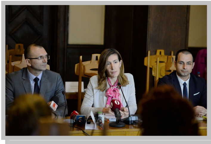
The Minister held a working meeting with representatives of the control and local authorities of the Burgas municipality to inspect the readiness for the upcoming summer season

inspect their readiness for the summer season. Everywhere there are optimistic expectations, and now it is important for the state and the industry to take the necessary measures to meet the expectations of tourists", Nikolina Angelkova stressed. She stated that it was agreed with the Ministry of Health and the Ministry of Interior to temporarily relocate their employees to take part in mixed inspection teams to exercise 24-hour control on noise. The initiative was launched in Golden Sands where the sector provided the necessary facilities. "I talked to the mayor of Obzor Hristo Yanev where a similar team will be situated. Given the importance of Sunny Beach and the great number of tourists in it, we will use best efforts to also have such on-the-spot supervision here", minister Angelkova said. She emphasized that this could be done in other settlements as well, in cooperation with the industry and local authorities.