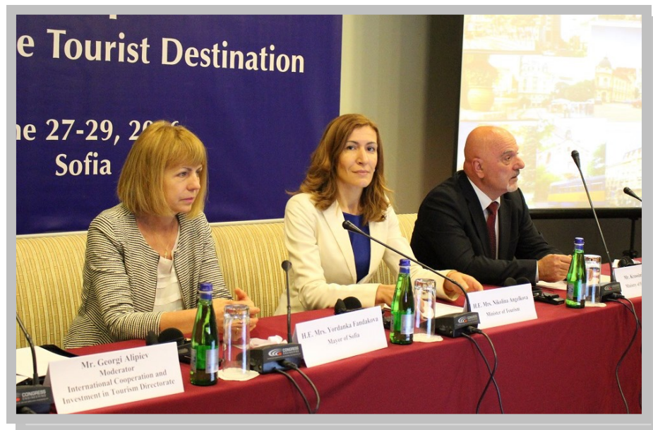
Minister Angelkova and the Sofia mayor Yordanka Fandakova opened a SEECP international conference

– sustainable tourism destination. Role and contribution of the media for the sustainable development of destinations”, held in Sofia on June 28th . The event was attended by the Mayor of Sofia Municipality Yordanka Fandakova, Krasimir Tulechki, director of “Eastern Europe” Directorate in the Ministry of Foreign Affairs, representatives of the SEECP member-states, the European Tourism Commission, tourist associations, media etc.