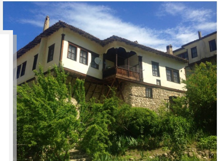
Karsoburi house in the village of Melnik

Not many nations can rival Bulgaria in winemaking history stakes, as grape growing in its fertile valleys can be traced back to Thracian times. The Struma River Valley beneath the rugged Pirin Mountains – one of Bulgaria's five official wine regions – is home to Melnik, a tiny village of grand National Revival-style houses overlooked by