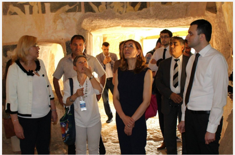
Minister Angelkova and Commissioner Crețu during their tour of the Ivanovo Rock Churches which are included in the UNESCO World Heritage List

After the opening of the conference, Minister Angelkova, Commissioner Crețu and Deputy Prime Minister Danku visited “Baba Tonka” High School of Mathematics in Ruse to get acquainted with the results of the project entitled “ICT – a force for change in education” co-funded by the Cross-border Cooperation Programme Romania – Bulgaria 2007 – 2013. Various specialized classrooms were equipped and modernized under the project.