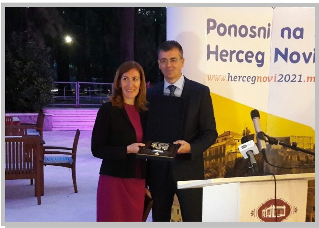
Minister Angelkova and the Minister of Sustainable Development and Tourism of Montenegro Branimir Gvozdenović

According to data of the National Statistical Institute in the first 4 months of 2016 some 2,000 Montenegrin tourists visited Bulgaria, while more than 1,200 Bulgarians travelled to Montenegro through the same period. It is highly prospective to develop common prod-