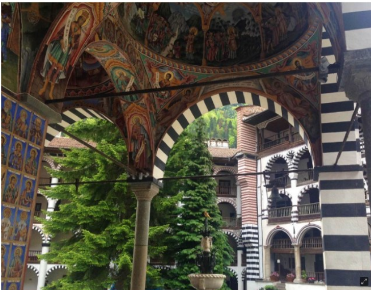
UNESCO World Heritage-listed Rila Monastery

The capital Sofia has been busy rediscovering its Thracian and Roman roots in recent years, while the ancient city of Plovdiv is preparing to be the 2019 European Capital of Culture. But the ultimate historical and cultural experience in Bulgaria remains the venerated Rila Monastery – the guardian of national identity and Orthodox faith throughout the Ottoman era.