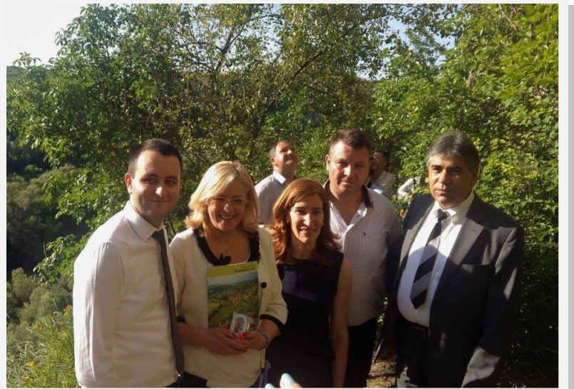
Minister Angelkova and Commissioner Crețu visited some of the region’s landmarks, including the Ruse Lom and the Ivanovo Rock Monasteries