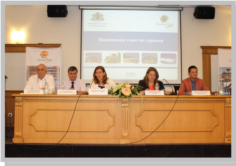
Minister Angelkova presented the Annual National Advertising Programme during the external meeting of the National Tourism Council in Velingrad

Austria etc.", said Minister Angelkova. According to her the draft programme includes 13 new offers for participation in oversea exhibitions, but the Bulgarian attendance will depend on the activity of the sector. Among them are exchange markets in Lithuania, Latvia, Estonia, India, China etc.