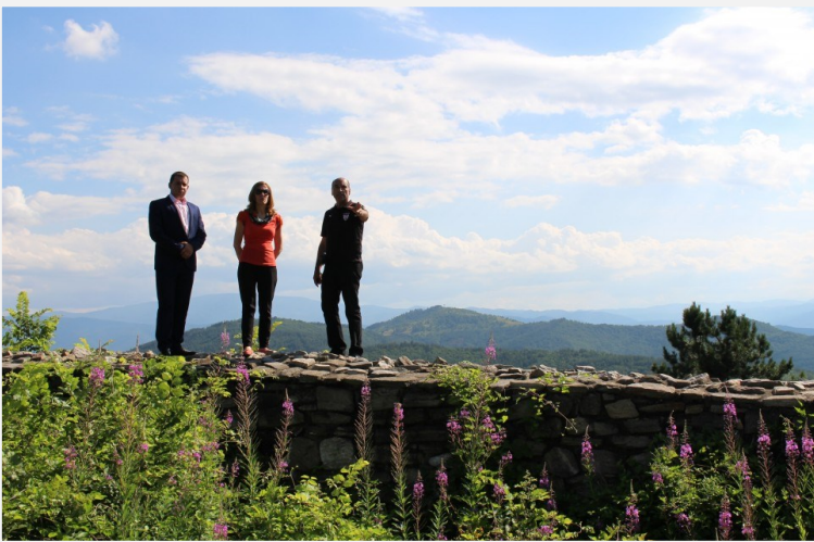
Minister Angelkova visited some of the landmarks of the Batak and Rakitovo municipalities

Another advantage of the region is its location not far from the capital, which gives further perspectives for both pushing upward the domestic tourism and attracting foreign tourists thanks to Trakia Motorway, which is on the road from Asia to Europe. According to Minister Angelkova, Tsigov Chark can also offer accommodation facilities.