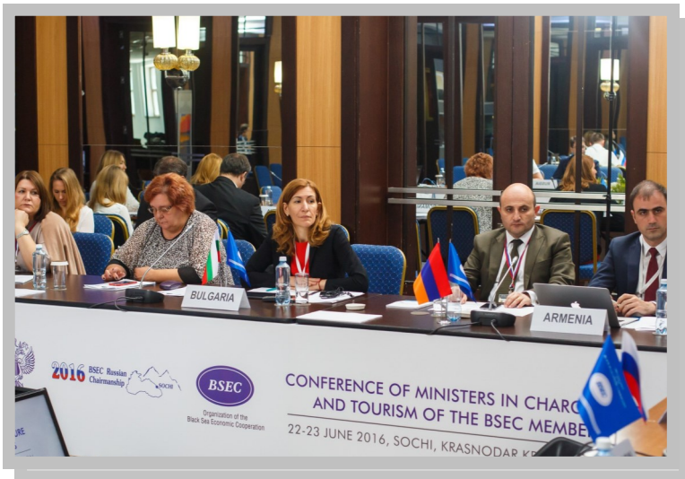
Minister Angelkova during the conference of ministers of the BSEC countries

trips within the Organization by developing common products, which could attract more tourists from distant markets. “We must utilize the past experience gathered from the cooperation in the Danube region to further improve the achieved results” she said.