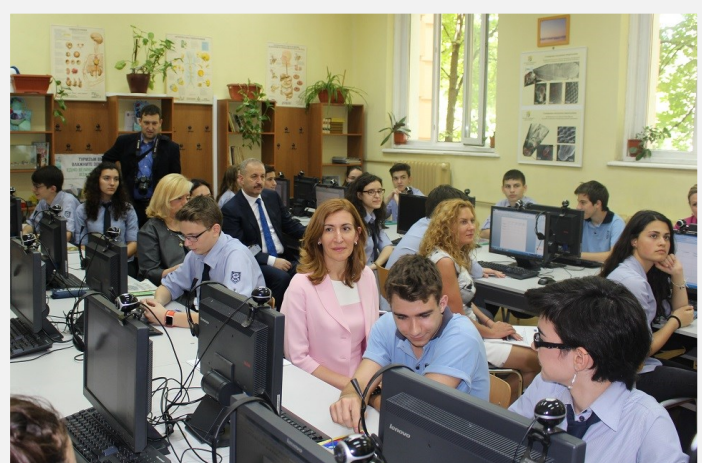
One of the modernized and fully equipped classrooms under the Cross-border Cooperation Programme Romania-Bulgaria 2007-2013 “ICT—a force for change in education”