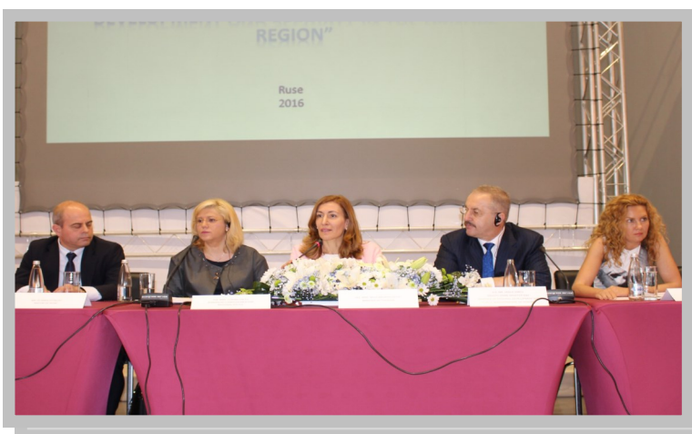
Minister Angelkova and EU Commissioner Corina Crețu during the opening of the Conference on Tourism Development and Security in the Danube region

Tourism is an essential pillar in the economies of the countries of the Danube region. In the last year over 132 mln. foreign tourists visited the countries of